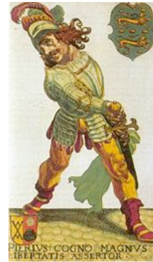
Etching of Grutte Pier, from 'Chronycke ofte Historische Geschiedenis van Friesland' published in 1622

...Wa dat net sizze kin, Is gjin oprjochte Fries!